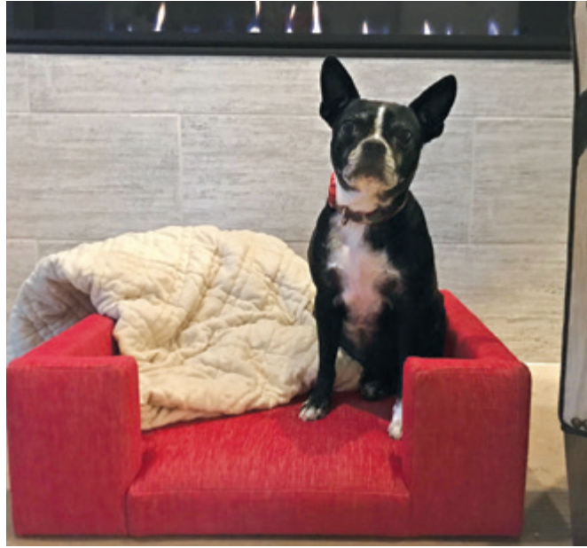
Winnie in her custom furniture bed (left); Sadie lounges in her recessed crate (right); High-performance fabrics protect furniture from pup's paws (below).